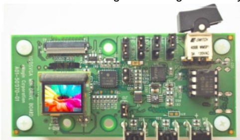
DSVGA shown with Interface & Development Kit (IRDK) mini-board.