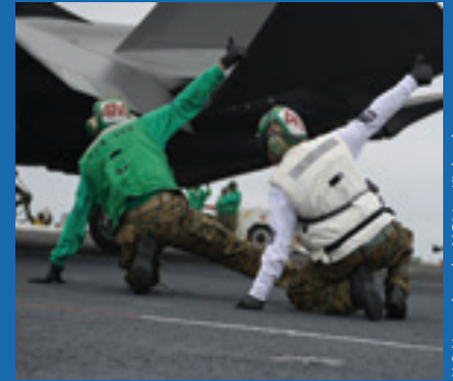
Sailors signal that a VFA-125 F-35C is ready to launch from USS Nimitz.

The advancement of these capabilities enhances a pilot’s situational awareness and reduces workload during low-light night carrier landings. When combined with the F-35C’s stealth technology, state-of-the-art avionics, advanced sensors and weapons capacity and range, the latest HMDS provides pilots with an advanced aircraft interface that offers unprecedented air superiority and advanced command and control functions through fused sensors. These state-of-the-art capabilities give pilots and combatant commanders unrivaled battlespace awareness and lethality. 🦅