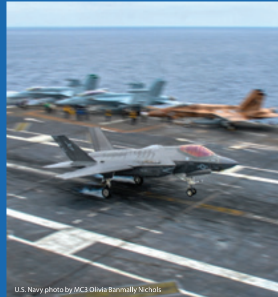
The Raiders land their F-35C on the flight deck of USS Nimitz.