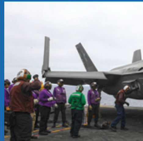
Sailors inspect a VFA-125 F-35C before it launches.