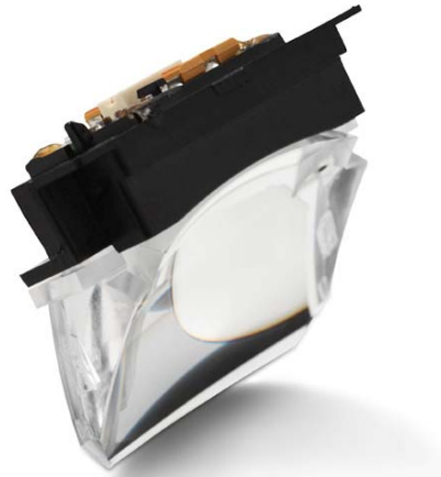
Lightweight and low cost eMagin's WFO5 Prism Optic delivers field of view of nearly 40 deg with >60% light throughput.

The WFO5 optic is available as an individual component or sealed to an eMagin OLED microdisplay as the basis for a compact display system.